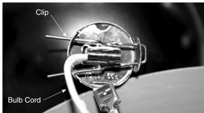
Figure 2. Remove the clip to separate the bulb assembly from the reflector.

To replace the bulb, unthread the spotlight head by turning it counterclockwise. Make certain the old bulb and the reflector have had plenty of time to cool down before you touch either one. Separate the reflector from the bulb by removing the clip shown in Figure 2. The entire bulb assembly, including its cord (color white), is removed by detaching the end of the cord from the connecting clip within the spotlight housing. Replace the bulb assembly, and reassemble the spotlight.